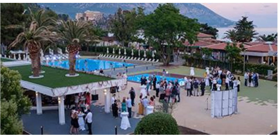
Reminder: NF Representatives cannot stay at Team Delegations' Hotels.